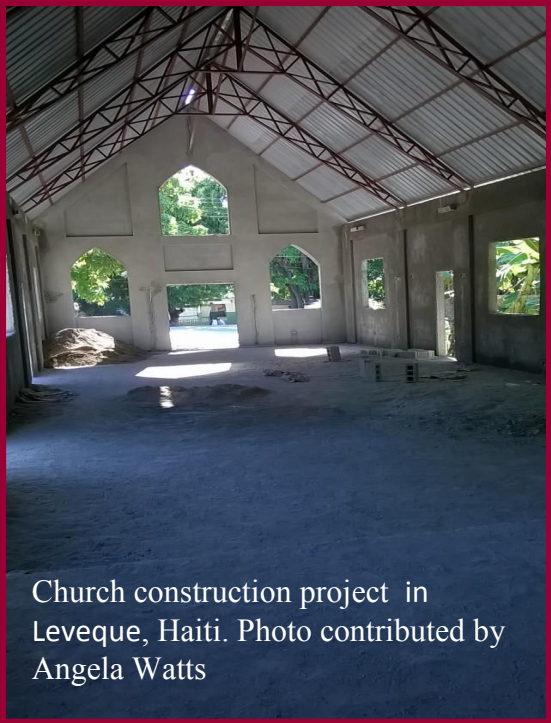
Church construction project in Leveque, Haiti.